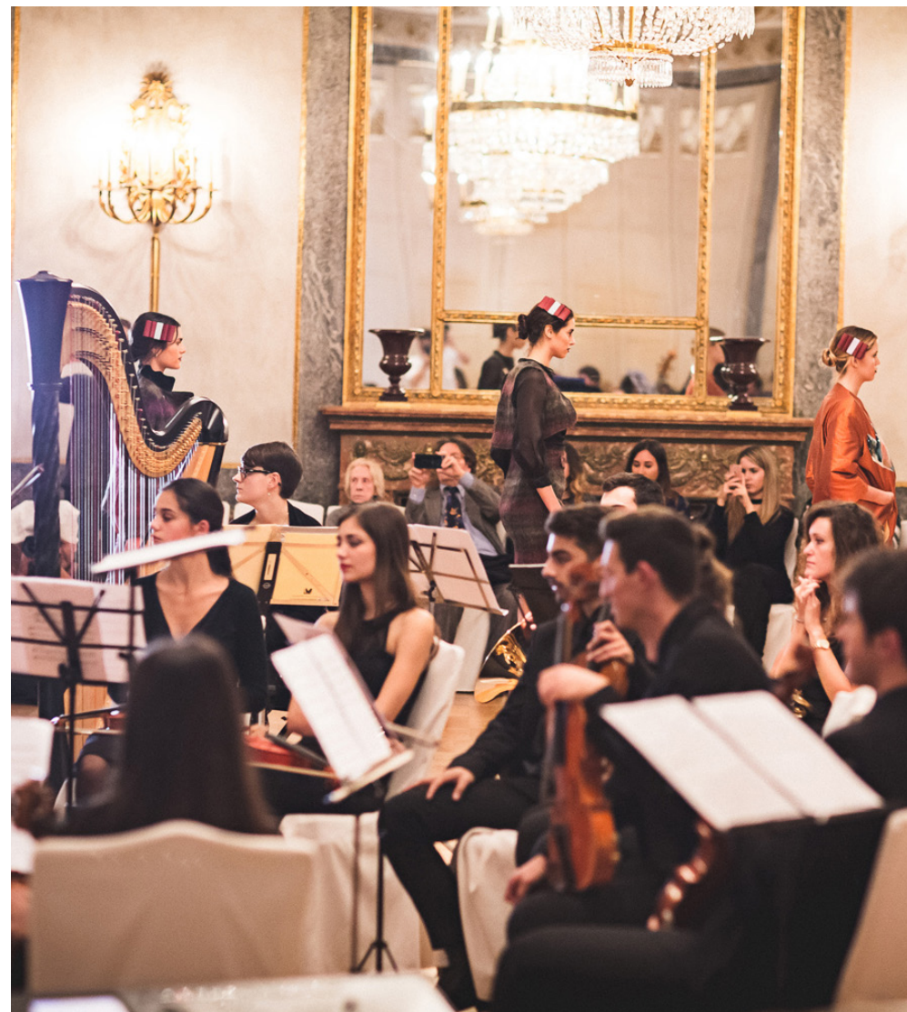
Sfilata del brand Gentile Catone, accompagnata dall'orchestra, presso il Westin Excelsior.

Attraverso un concept originale, GD Major Entertainment sta producendo una serie di documentari incentrati sull'evento Green Fashion Week, conferendo alla struttura classica del documentario una veste romanzata e unendo il linguaggio del documentario a quello di altri generi cinematografici quali la fantascienza, il film d'avventura e il film d'azione, al fine di fidelizzare e rendere partecipe lo spettatore al tema della sostenibilità con uno stile innovativo. In un mix d'interviste reali e fittizie, di casi concreti e situazioni irreali, tra veri articoli di moda e notizie di fantasia, gli stilisti di Green Fashion Week diventano veri attori protagonisti, recitando in prima persona e al contempo lanciando il loro messaggio di sostenibilità assieme a modelle/i e attori professionisti durante le sfilate e gli eventi.