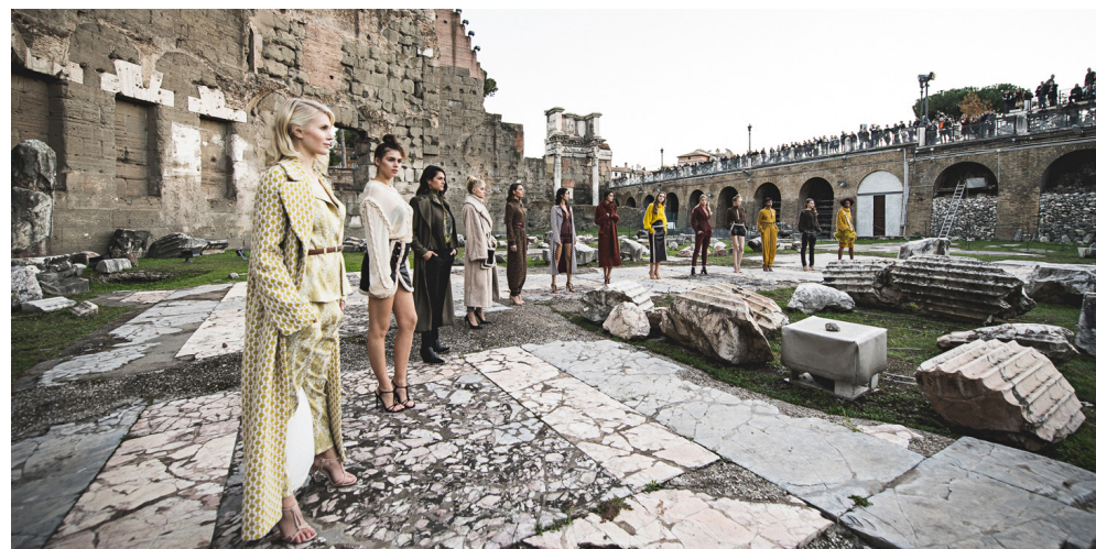
Sfilata della designer Orushka presso il Foro di Augusto.

Il 25 settembre 2015, i 193 Paesi membri delle Nazioni Unite hanno aderito all'agenda 2030 in cui sono contenuti i 17 obiettivi di sviluppo sostenibile OSS (Sustainable Development Goals - SDGs) non solo riguardo al piano ambientale, ma anche quelli economico e sociale, promuovendo una crescita economica duratura, inclusiva, sostenibile e in piena e produttiva occupazione, al fine di garantire un lavoro decoroso per tutti.